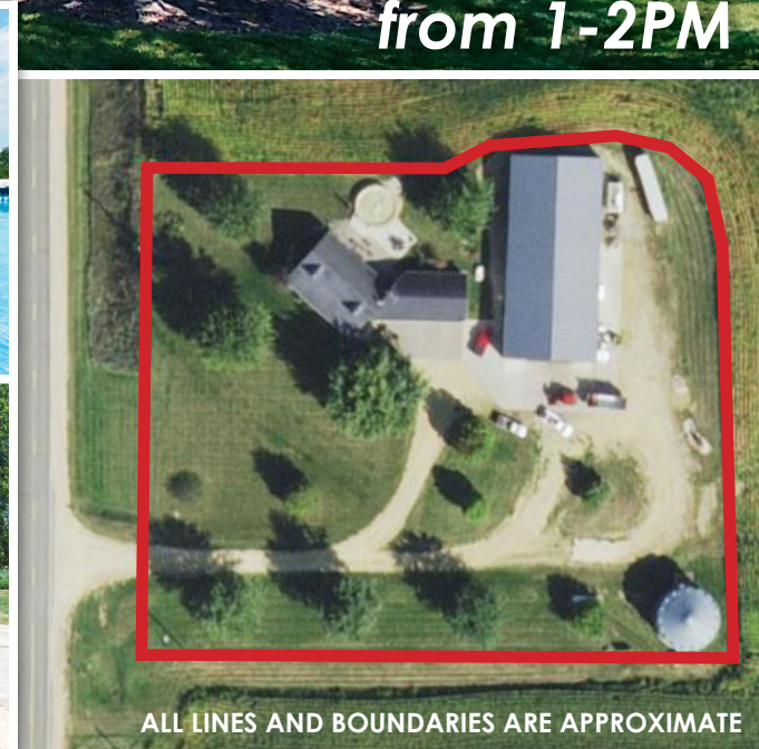
ALL LINES AND BOUNDARIES ARE APPROXIMATE